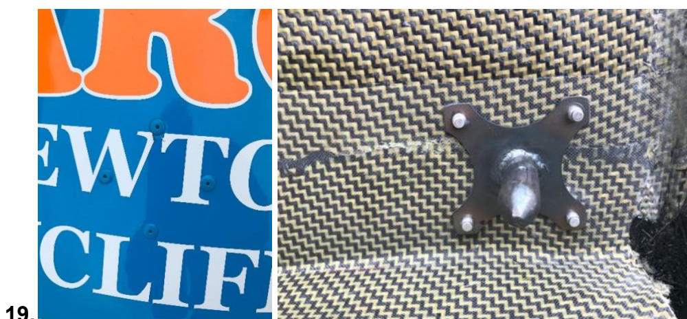
20. EXAMPLE OF TOP AND BOTTOM VIEW OF PIN 21. (BOTTOM VIEW PIN PRIOR TO BONDING)

18.2.2. All main mounting pins/plates forward of the steering head must be secured to the bodywork with a steel plate no smaller that 100mm square. This must be both riveted and bonded (e.g. fibreglass/resin) to the bodywork in order to render it a permanent and secure fixing point. For verification purposes all Rivet Heads must be intact and visible on the outside of the bodywork.