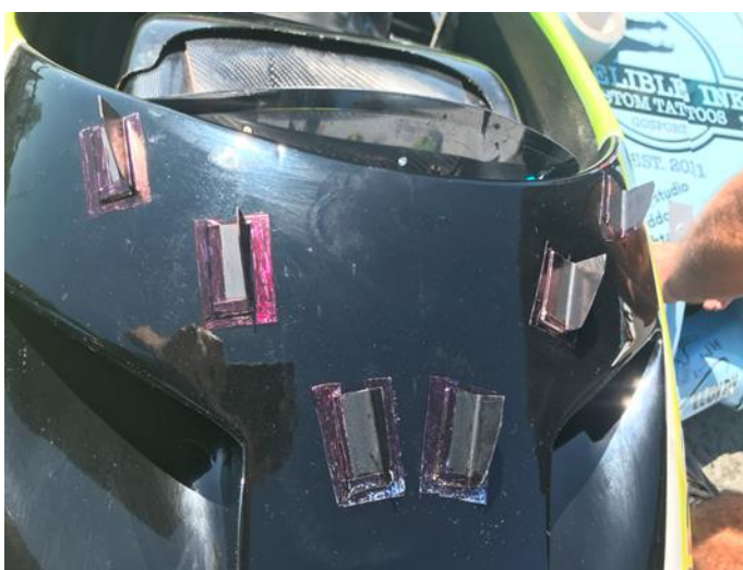
EXAMPLE OF NON-CONFORMING STRAKES